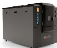
Metavision-RX Extremely rugged oil analyzer