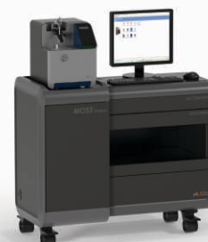
MOSS Compact and affordable