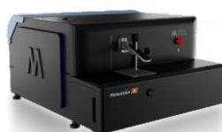
Metavision-8i Laboratory powerhouse