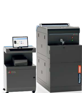
Metavision-10008X The zenith of sensitivity