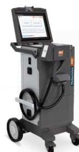
Mobile-OES High performance on wheels